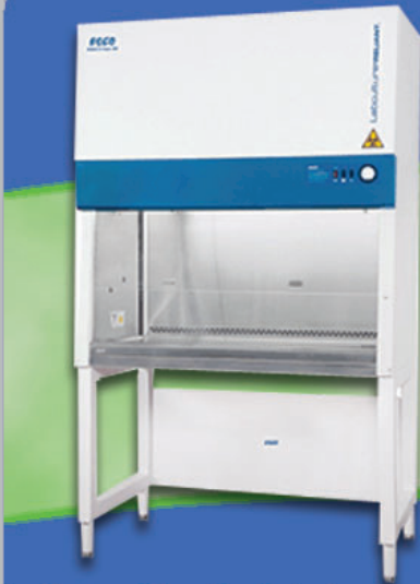
Shown with optional stand